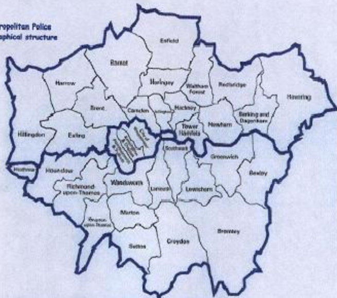
Metropolitan Police Geographical structure

The Metropolitan Police policing area is divided not into divisions like Surrey Police, but is divided into boroughs. They don't have a Divisional Commander in charge of a division, as do Surrey Police, instead they have a Borough Commander in charge of each borough. The Borough